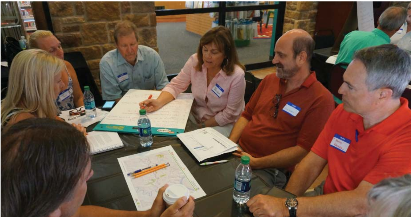
Community Forum 1 Group Activity and Voting